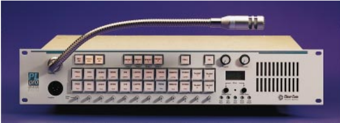
MS-812A Front View