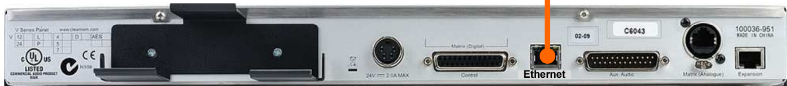
V-Series rear panel