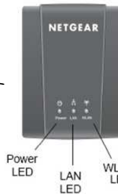
Netgear WNCE 2001 Wireless Internet Adapter